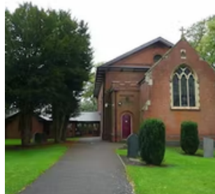
ST PAULTS CHURCH STOCKINGFORD