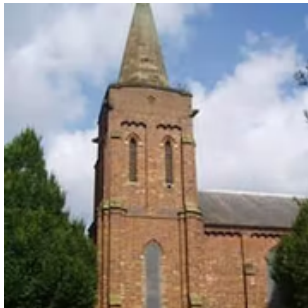
HOLY TRINITY ATTLEBOROUGH CHURCH