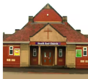
HEATH END ROAD CHURCH